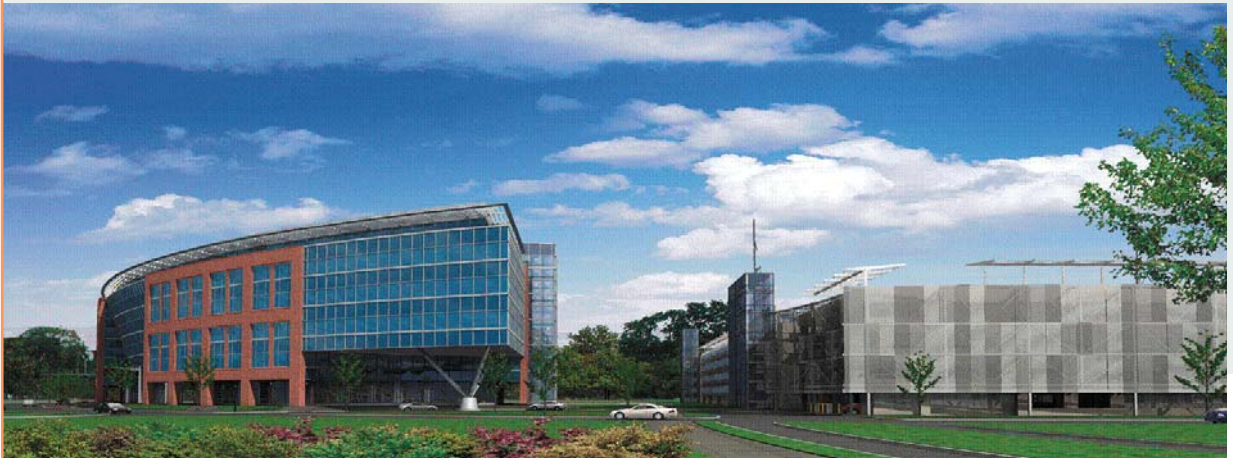
Christina Crescent, located on a reclaimed brownfield property, consists of an office and retail building and an adjacent parking structure. Each of the structures will have a living green roof, and when completed will be Delaware's largest with LEED certification.

As the transformation of the Wilmington Riverfront from industrial wasteland to thriving urban center continues, the area will also be a showcase for this unique project in sustainable design.